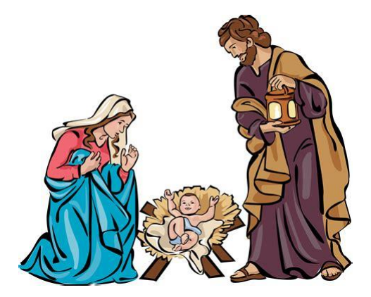
"...They name him Wonder-Counselor, God-Hero, Father-Forever, Prince of Peace." (Isaiah 9:5)