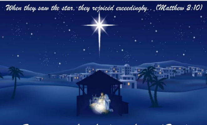
For unto you is born this day in the city of David a Savior, who is Christ the Lord. (Luke 2:11)